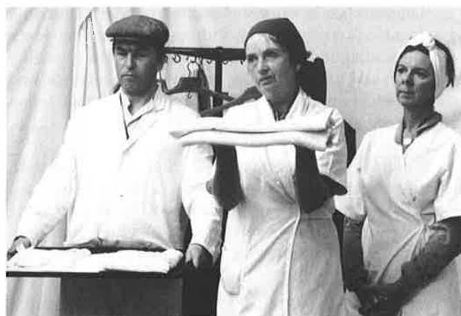
"Soapsud Island" performed by Questors Theatre Ealing, following training with Age Exchange in Reminiscence Theatre.