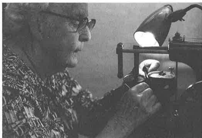
A retired glove maker demonstrates her craft at the Somerset Reminiscence Festival.