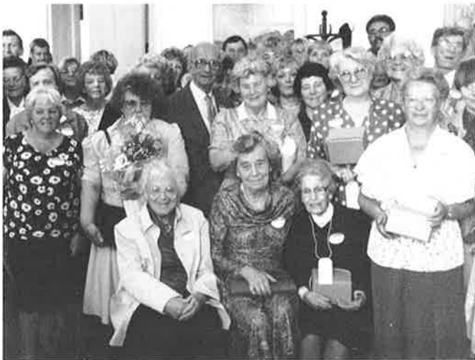
Contributors to the evacuation book present at the launch, held at the Imperial War Museum.

'On The River', our book of memories of the docks and of the Thames as a working River, was published in June 1989, and sold very well during its 1989 tour. We have sold out of our paperback stock, but we still have a large stock of the hardbacks, and we have already virtually recouped our production costs.