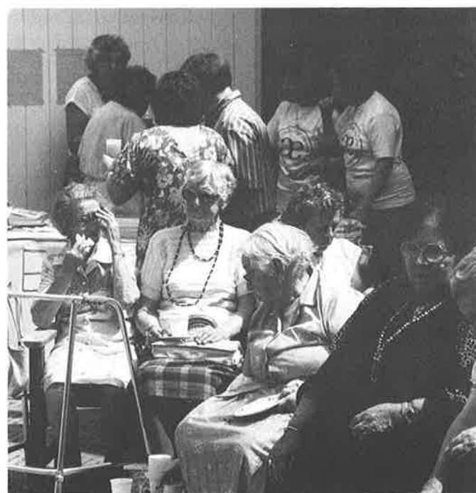
Crowds of elderly people came from all over South Somerset on a glorious sunny day and enjoyed a Festival lunch in the open air.