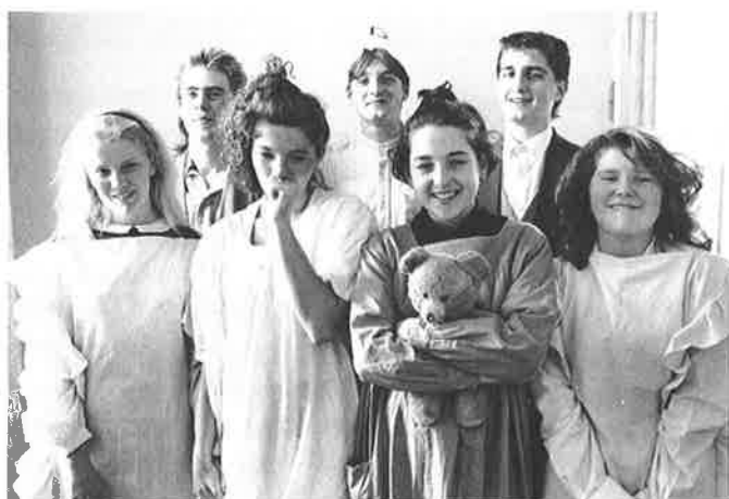
6th Form pupils of Ryde High School in "Pocketful of Dreams", their reminiscence play for elderly people, arising from work with Age Exchange.

The young people wanted to include reminiscence theatre in their examination submission. They took their work with old people in residential homes very seriously, and produced a really first class piece of drama based on the memories they collected. Their work gave pleasure to large numbers of elderly people on the island.