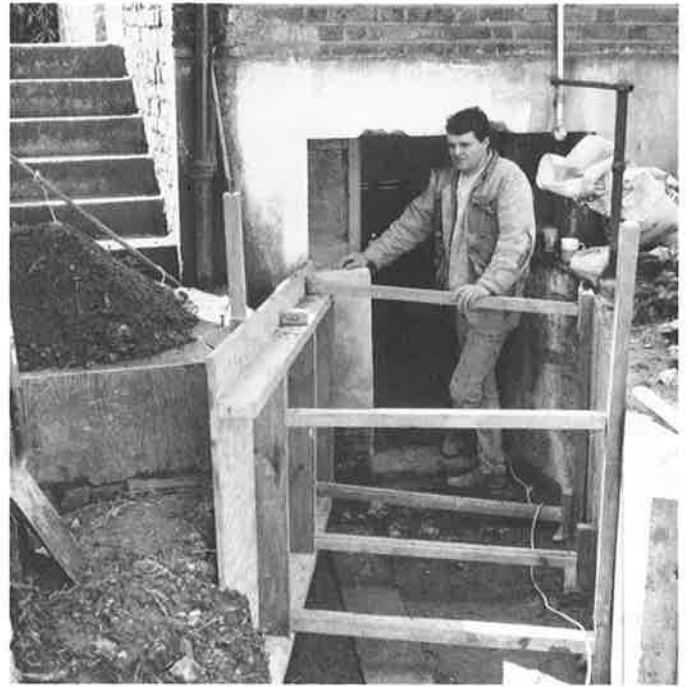
Building the disabled access ramp to the darkroom.

On capital account, the company spent £10,129 on improvements to premises – mainly disabled access to the darkroom – all of which was fully funded by grants.