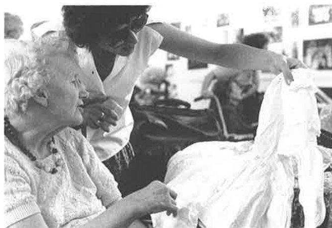
A connoisseur's eye on the reminiscence items on display in the Somerset exhibition at Dillington House, Ilminster.