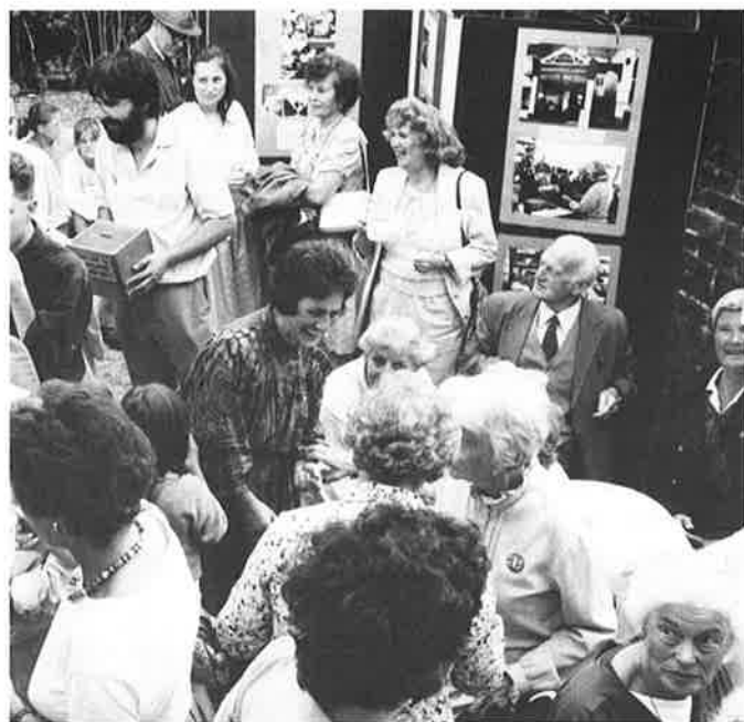
Crowds attending the launch of the evacuation exhibition were served wartime cocoa in enamel mugs.

The advent of the Age Exchange Newsletter, 'Memory Matters' has helped to put volunteers in touch with events at the Centre and out in the field, and many have contributed their own articles. This newsletter has also proved a valuable means of keeping staff and freelance workers in touch with the project.