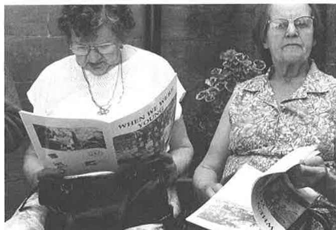
Hot off the press, the Somerset memories in "When We Were Young" are snapped up at the Reminiscence Festival.

A group of residents in another old people's home produced a book of stories and also did some valuable education work on the theme of harvest with their local primary school. A Day Centre for elderly people with special needs also joined in the project, and particularly enjoyed the outings which resulted, especially to the festival itself, where they had a really good time.