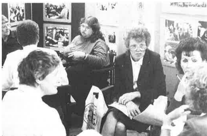
A training course in reminiscence for health and social services workers at the Centre.