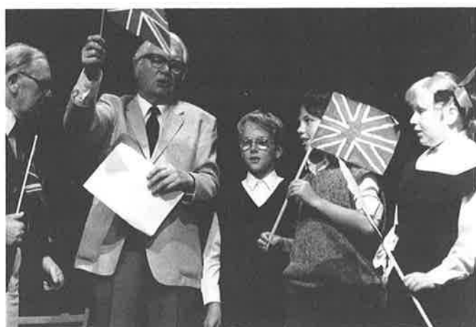
Age Exchange Somerset style. Children from Avishayes Primary School in Chard with members of the reminiscence group whose stories they were dramatising.

Two groups worked closely with village school children to produce reminiscence plays like our own Youth Theatre shows, and learnt an enormous amount in the process. In both these cases, the work across the generations will definitely continue and flourish as a result.