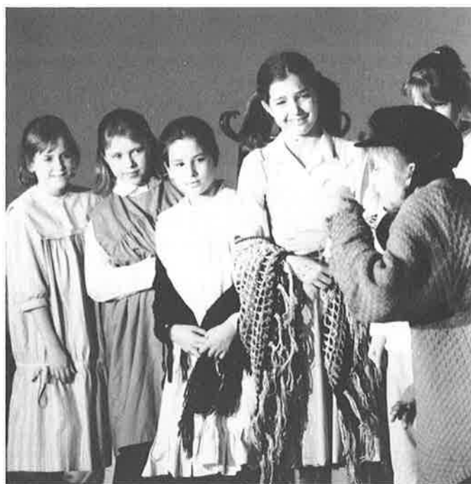
Younger members of the Youth Theatre in "Streetwise" based on older people's memories of the streets where they grew up.