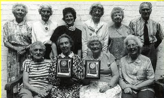
Members of the Good Companions with the trophies they won in Ireland

The visit to County Roscommon in June, at the invitation of the Adult Education Board, and the kind sponsorship of the Roscommon Lions Club, was a memorable occasion. Roscommon is described as the "Heart of Ireland". We discovered that the people indeed possessed "Big Hearts". Our days (and evenings) were fully occupied. Our hosts ensured that we had a most interesting time, the kindness and friendly welcome we received was heart-warming.