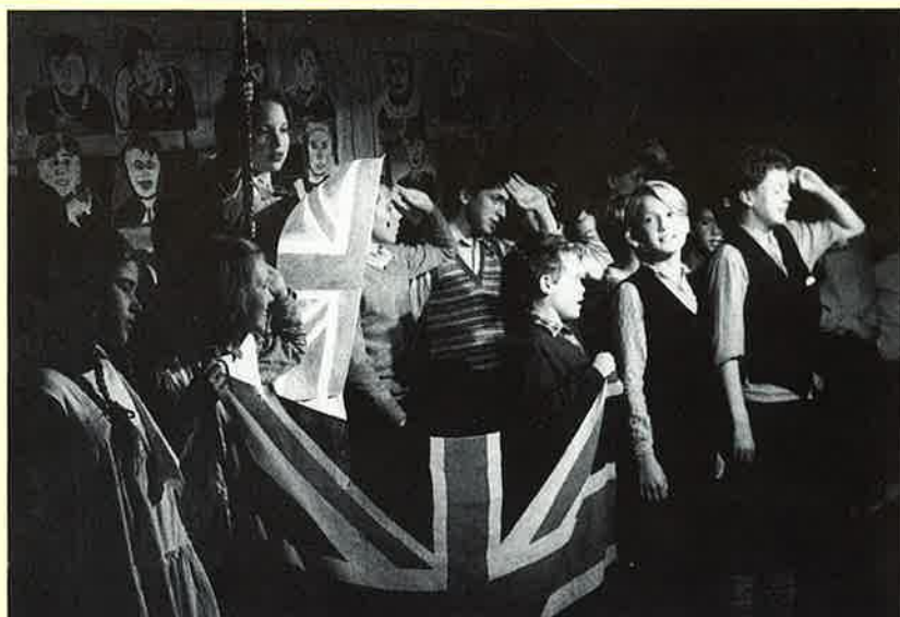
1987 Youth Theatre show on older people's schooldays memories

1990 "GOODNIGHT CHILDREN EVERYWHERE", our biggest and best book to date, is launched at the Imperial War Museum, with eighty of the contributors present. The Theatre in Education programme on this theme for London school children at the Reminiscence Centre is filmed by the BBC for their PRIMETIME programme with David Jacobs.