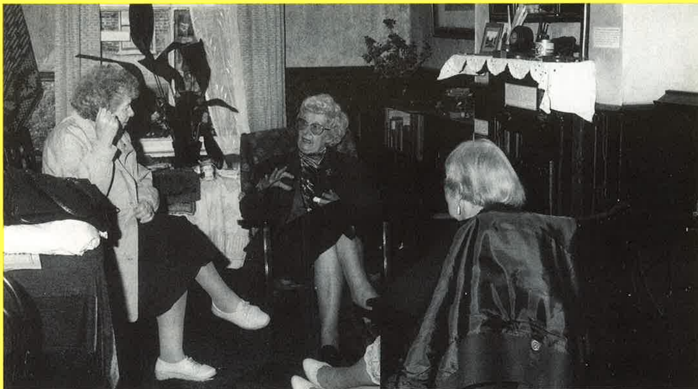
By the fireside, friends enjoy the cosy winter evenings exhibition at the Reminiscence Centre, winter 1992