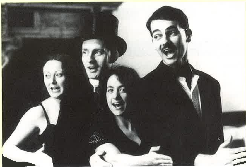
1983 'The Fifty Years Ago Show' our first professional production

1983 Age Exchange Theatre Company is formed. "THE FIFTY YEARS AGO SHOW" is launched at Greenwich Festival. It is based on the memories of older people from four sheltered housing units in Greenwich. These memories are preserved in "THE FIFTY YEARS AGO BOOK", the first of 25 Age Exchange publications to date.