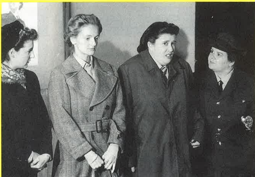
Raw recruits to the WAAF suffering in Age Exchange Theatre Company's touring show 'What Did You Do In The War Mum?' which is playing in Britain and Europe as part of the European Year of Older People

The resulting piece was taken to Germany in May. There it played to an enthusiastic audience of carers and social workers, and also to the Cologne older people's theatre group with whom the Good Companions soon became good friends. We were wonderfully looked after in Germany, many of our older people making their first ever trip there. We hope to be able to repay some of the hospitality we received when