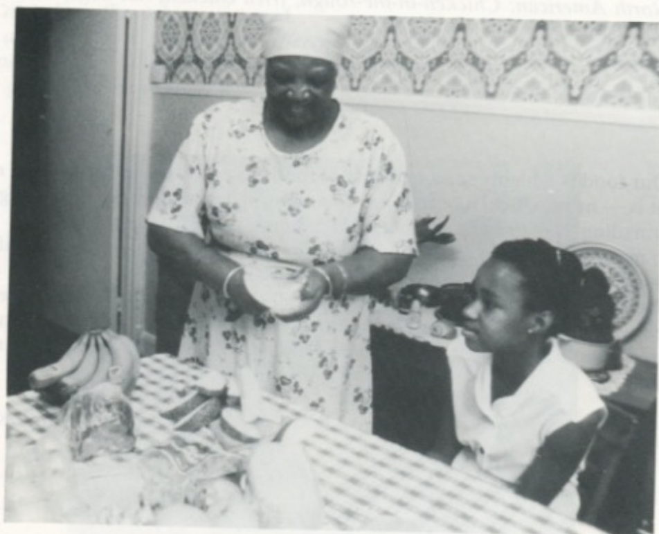
A Jamaican woman shows her grand-daughter how to prepare breadfruit when making mutton soup.

These days, I don't buy much of the organic foods — the yam, sweet potato and that — once in a blue moon I'll buy a bit of yam. Mainly I'll eat the standard vegetables for this country — potato, carrot, turnip. Swede I don't eat that much, but most other things I eat plenty. Bacon I'll eat, and maybe a bit of ham. I still eat a lot of rice, and of course beans and peas.