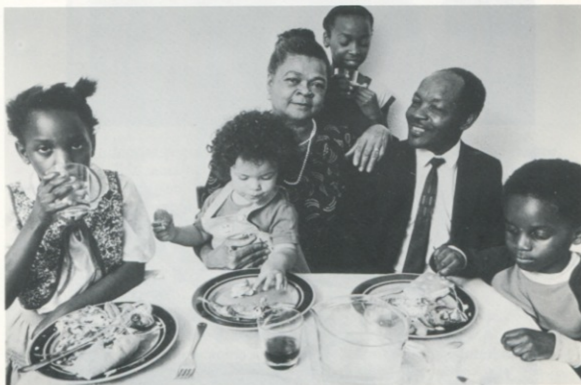
Jamaican couple with grandchildren eating traditional meal of fried snapper, (fish), dumplings, cocoa bread and patties.