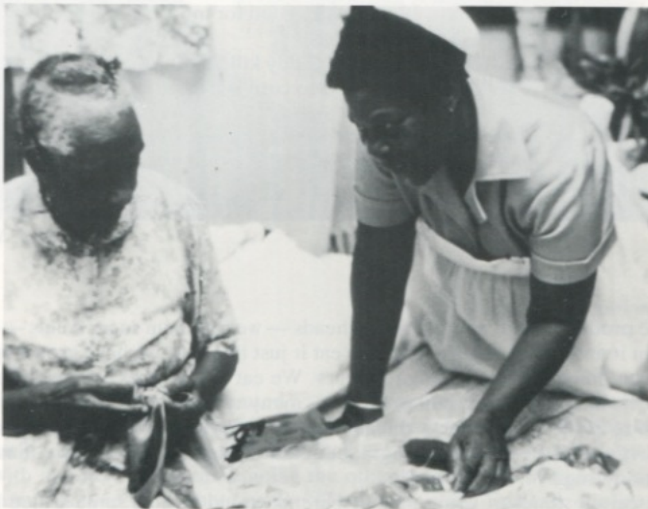
Jamaican Government Infirmary

In the old days in the countryside, midwives were not trained specially so maybe the grandmother took charge and delivered babies. If there was a problem with the birth, you had to attend a clinic. There was a clinic in Linstead, St. Catherine Jamaica, there was a clinic in Point Hill also.